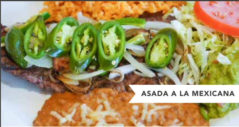
ASADA A LA MEXICANA