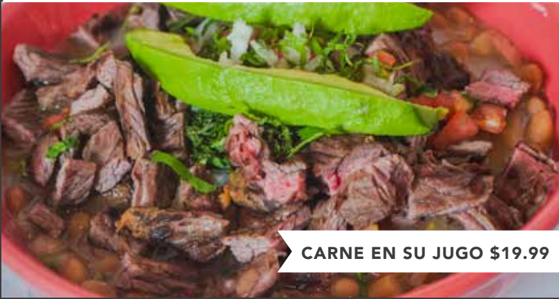
CARNE EN SU JUGO $19.99