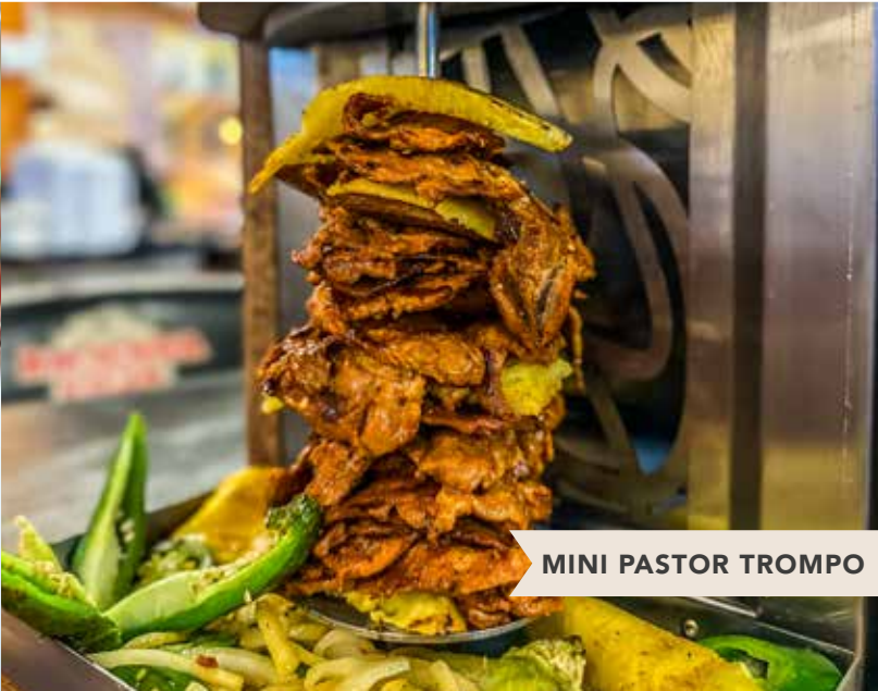
MINI PASTOR TROMPO