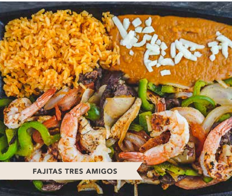
FAJITAS TRES AMIGOS