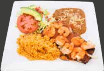
ASADA A LA DIABLA