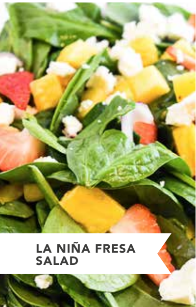
LA NIÑA FRESA SALAD