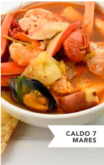
CALDO 7 MARES