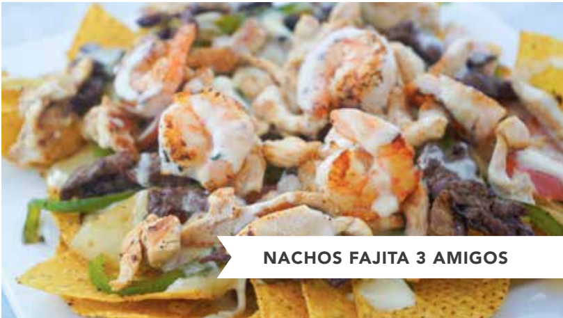
NACHOS FAJITA 3 AMIGOS